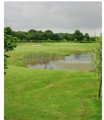
The first green viewed over the lake on the right hand side – a familiar line to the green for some !

The ties are on sale at a cost of €20 each and can be obtained from the bar or from the Treasurer.