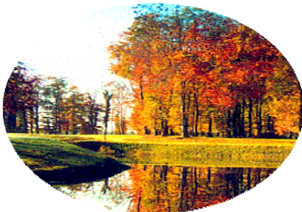
A view over the lake beside the 15 th green

..... Last week after finishing a round the mobile phone rings in the men's locker room. I answered it and the conversation went as follows ☺