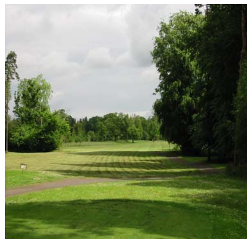
The tee shot on the 8 th – looks even narrower from this shot doesn't it.